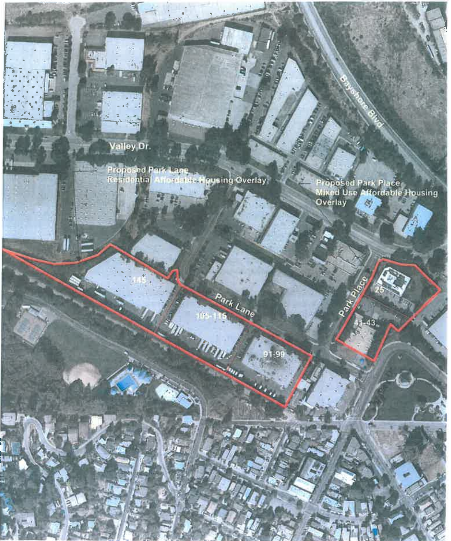
Figure HE.2 City of Brisbane Proposed Re-zoning Sites